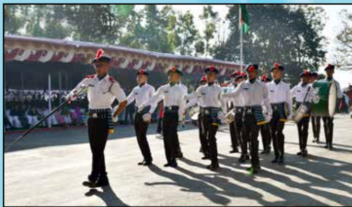
Band display by School Band during the Republic Day Celebrations at Kangla Fort, Imphal