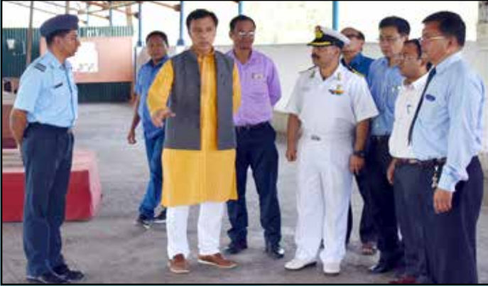
The Hon'ble Education Minister during inspection of school main building

various issues were discussed for the welfare and development of the school. The Hon'ble Minister expressed his delight over the outstanding performance and achievements of the cadets in various fields. He stressed upon the improvement of the infrastructure of the school and necessity for construction of a new Academic Block and Hostels. Further, he inspected the construction site of the new school auditorium.