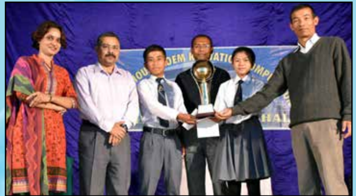
Raman House – Champion of Inter-House Manipuri Poem Recitation Competition (Jr)