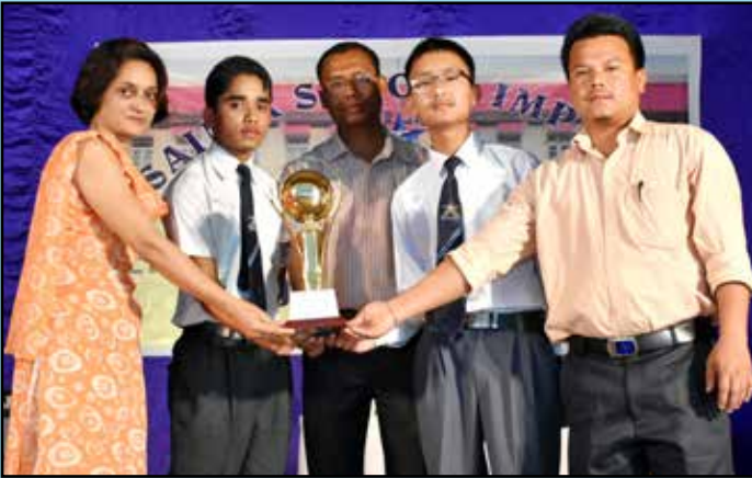
Netaji House – Champion of Inter-House English Debate Competition (Sr)