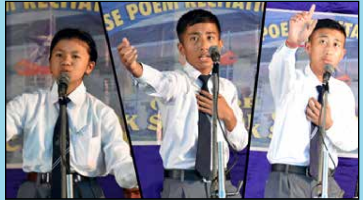
Cadets reciting their poems during the Inter-House Manipuri Poem Recitation Competition (Jr)