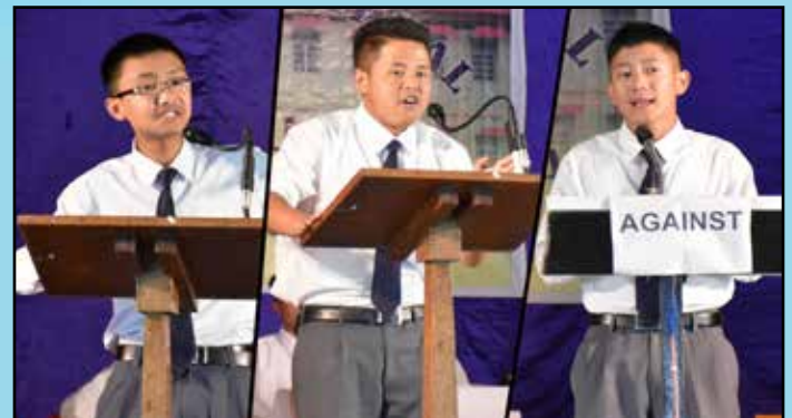
Cadets speaking during the Inter-House English Debate Competition (Sr)