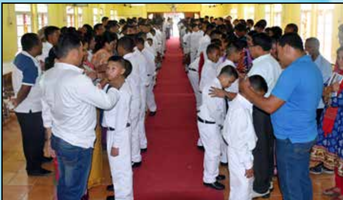
Cadets of Class VI being blessed by their parents on the occasion of 'Blessing Ceremony'

On the occasion, the Principal addressed the cadets and advised them to stay at the school with comfort and happiness. Educating the young cadets about aims and objectives of Sainik Schools, he urged them to maintain discipline and also to work hard with enthusiasm and devotion to accomplish their goal in life. A Bara-Khanna was organised as part of the Ceremony. In conclusion, cadets sought blessings from their parents for their success and well-being during their stay at the school.