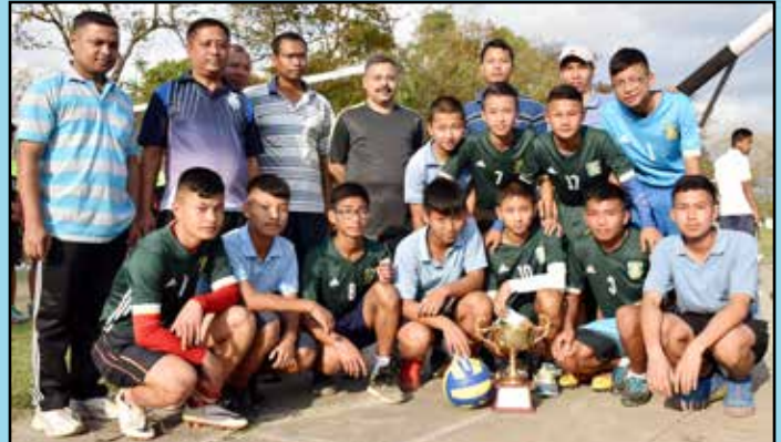
Tagore House – Champion of Inter-House Volleyball Championship (Jr)