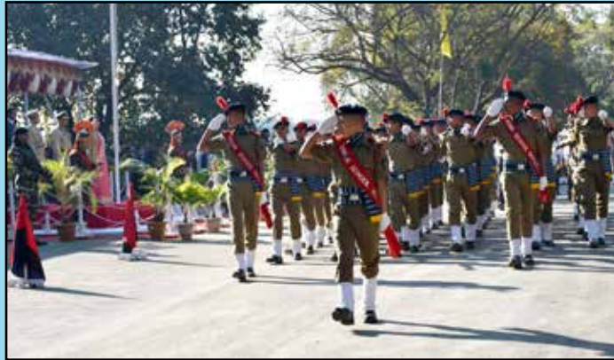
SSI Marching Contingent (Sr) during the Republic Day Celebrations at Kangla Fort, Imphal

As part of the celebrations, two contingents – ‘A’ and ‘B’ of 52 cadets each along with school band comprising 17 cadets of the school also took part in the State Republic Day Celebrations held at Kangla Fort, Imphal. In the March Past competition, school Contingent ‘A’ was adjudged best.