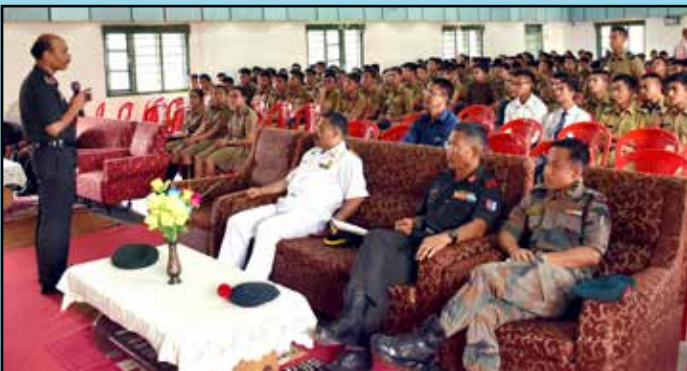
Defence Officers Alumni of SSI interacting with the cadets at Manekshaw Auditorium

Sainik School Imphal Alumni who are in Defence Services visited the school and interacted with cadets at the Manekshaw Auditorium on 04 May 2017 and gave a series of lectures to the cadets about their experiences in Defence Services. Reiterating the pride career in