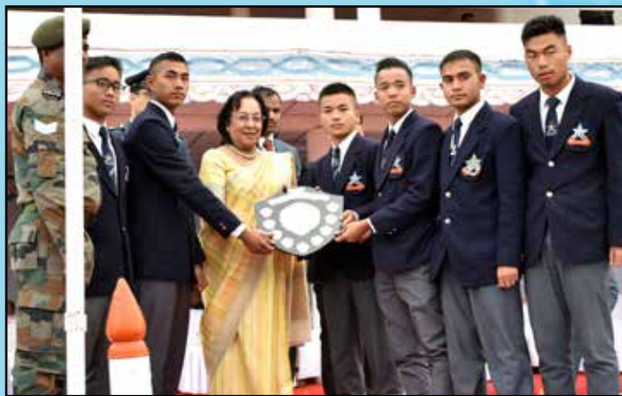
The School Contingent receiving the Shield for best Marching Contingent from Her Excellency, Dr Najma Heptullah, Governor of Manipur during the Republic Day Celebrations 2017