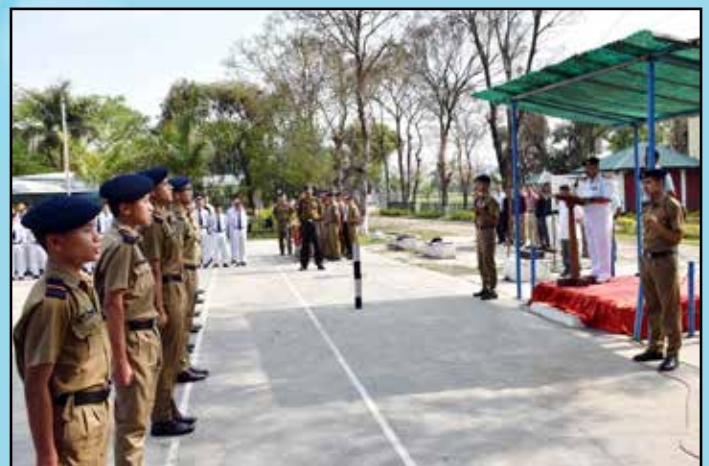
New Cadet Appointments taking 'oath' during the Investiture Ceremony

Investiture Ceremony for the first half of the academic session 2017-18 was conducted on 08 Apr 2017 to give ranks and badges to the cadet appointments. It is organised on half yearly basis in order to provide opportunities to maximum cadets to imbibe leadership qualities in them. On the occasion, the school Principal addressed the cadets and urged the new cadet appointments to render their duties and responsibilities in a fair and solemn manner.