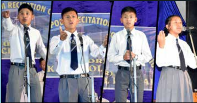
Cadets reciting their poems during the Inter-House English Poem Recitation Competition (Jr)