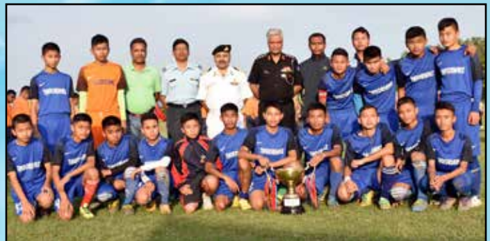
Tagore House – Champion of Inter-House Football Championship (Jr)