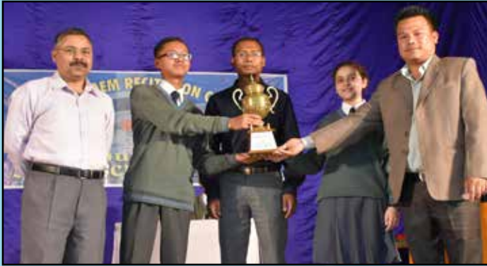
Netaji House – Champion of Inter-House Hindi Poem Recitation Competition (Jr)