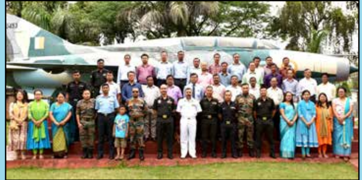
Defence Alumni of the School along with Principal, Vice Principal and other staff posing for the lens

Defence and aim of Sainik Schools, they motivated the cadets to join Defence Services. After briefing the cadets on the importance of co-curricular and sports in building the mind and body sound, the visiting officers also interacted with the staff during a tea party.