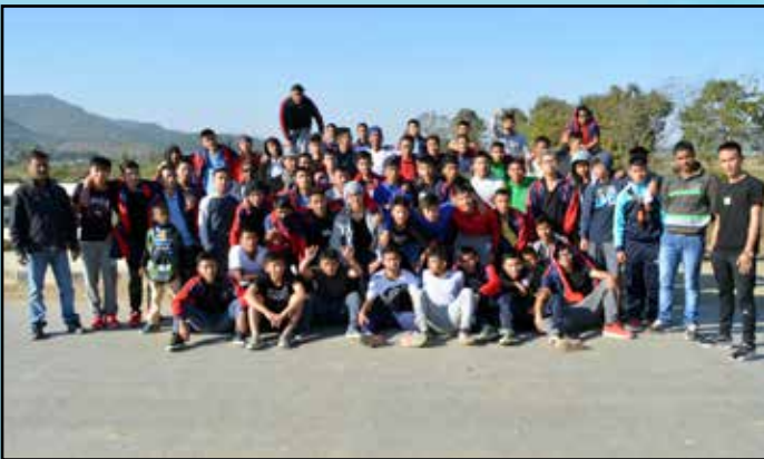
Class XI cadets on an outing at Serou, Kakching District on 22 Jan 2017