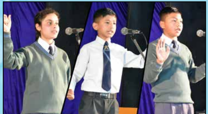
Cadets reciting their poems during the Inter-House Hindi Poem Recitation Competition (Jr)