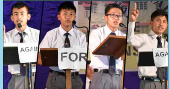
Cadets speaking during the Inter-House English Debate Competition (Jr)