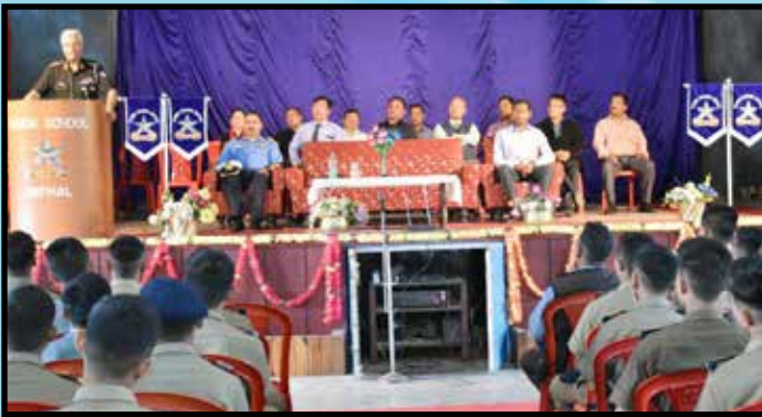
The Inspecting Officer addressing the staff and cadets at Manekshaw Auditorium

During an interaction with the staff members, various points pertaining to the welfare of the staff and the school's development were discussed. He assured the school of all assistance to improve its infrastructure from Sainik Schools Society. He also interacted with the cadets at the Manekshaw Auditorium and shared his experiences in Defence Services.