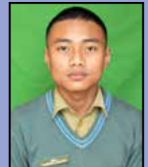
Adm No 3543 Cdt Tilobanta Class IX CGPA - 9.8