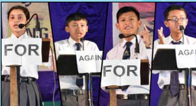
Cadets speaking during the Inter-House Hindi Debate Competition (Jr)