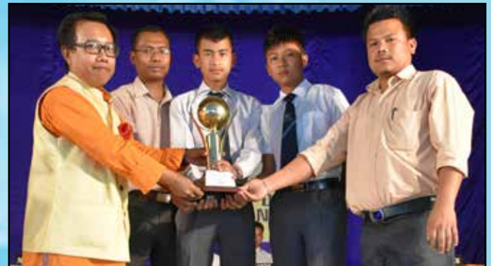
Netaji House – Champion of Inter-House English Debate Competition (Jr)