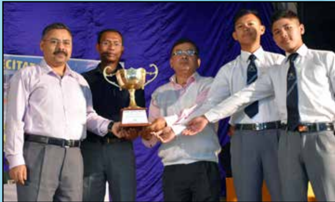
Shivaji House – Champion of Inter-House English Poem Recitation Competition (Jr)