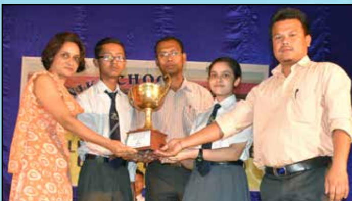
Netaji House – Champion of Inter-House Hindi Debate Competition (Jr)