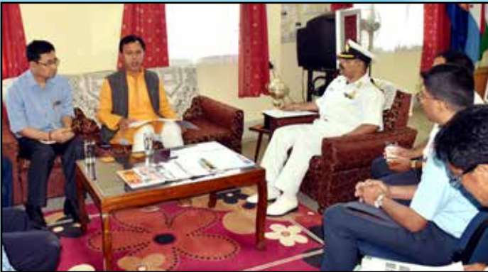
Hon'ble Education Minister interacting with Principal, Vice Principal and other staff at Principal's Office

various issues were discussed for the welfare and development of the school. The Hon'ble Minister expressed his delight over the outstanding performance and achievements of the cadets in various fields. He stressed upon the improvement of the infrastructure of the school and necessity for construction of a new Academic Block and Hostels. Further, he inspected the construction site of the new school auditorium.