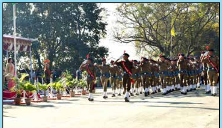
The School Marching Contingent (Jr) during the Republic Day Celebrations at Kangla Fort, Imphal