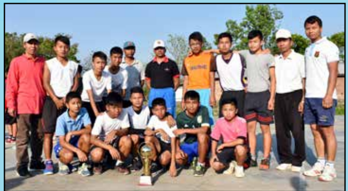
Tagore House – Champion of Inter-House Basketball Championship (Jr)