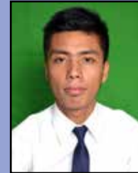
Adm No 3212 Cdt Canton Eng - 95%